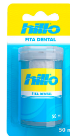
REF. 25-11279 Fita Dental c/50m