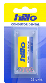
REF. 25-11187 Passa Fio c/25