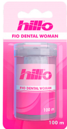
REF. 25-10814 Fio Dental 100m Woman