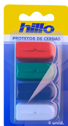
REF. 25-10760 Protetor de Cerdas c/4