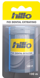
REF. 25-11125 Fio Dental 100m Extra Fino