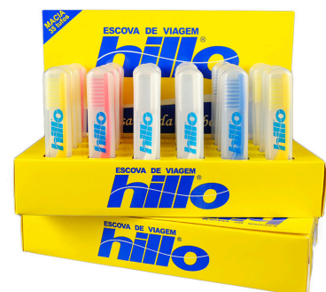
REF. 25-10517 Display c/ Escova de Viagem c/24 un