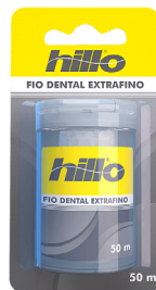
REF. 25-11262 Fio Dental 50m Extra Fino