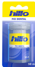
REF. 25-11156 Fio Dental 50m Convencional