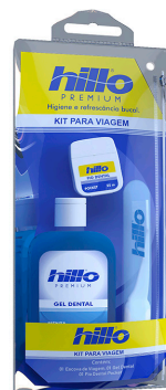
REF. 25-11767 Kit Viagem