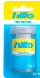
REF. 25-11132 Fita Dental c/100m