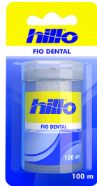
REF. 25-11118 Fio Dental 100m Convencional