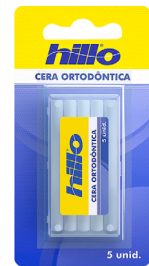
REF. 25-10821 Cera Orto c/5