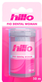
REF. 25-10791 Fio Dental 50m Woman