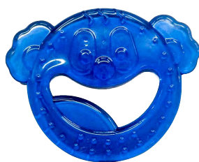
REF. 07-1026-MO Mordedor Macio Pepetinha Sortido Az/Rs/Vd/LL/Bco