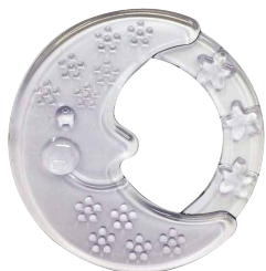
REF. 07-1027-MO Mordedor Macio Lua Sortido Az/Rs/Vd/LL/Bco