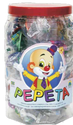
Pote de Chupetas c/50 un.