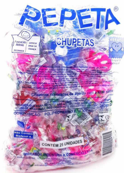
Saco de Chupetas c/25 un.

REF. 07-0006-P2 – Pote c/25 un. REF. 07-0006-S2 – Saco c/25 un. REF. 07-0006-P5 – Pote c/50 un.