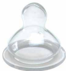
REF. 07-0003-S1 Bico Big Ortodôntico Saco (pacote c/10)