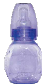
REF. 07-4571-P1 Mamadeira Pepetinha 60 ml Sortido Az/Rs/Vd/LL