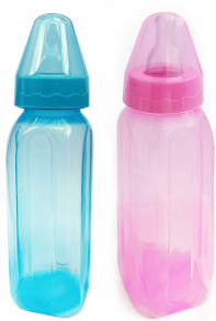
REF. 07-9010-MA Mamadeira Retrô Convencional 240 ml Sortido Az/Rs