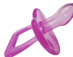
REF. 07-0129-S1 Chupeta 100% Silicone (pacote c/10) sortidos