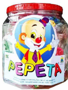
Pote de Chupetas c/25 un.