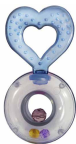
REF. 07-1021-MO Mordedor c/Chocalho Sortido Az/Rs/Vd/LL/Bco