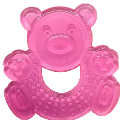
REF. 07-1024-MO Mordedor Macio Urso Sortido Az/Rs/Vd/LL/Bco