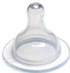
REF. 07-0008-S1 Bico Big Redondo Saco (pacote c/10)